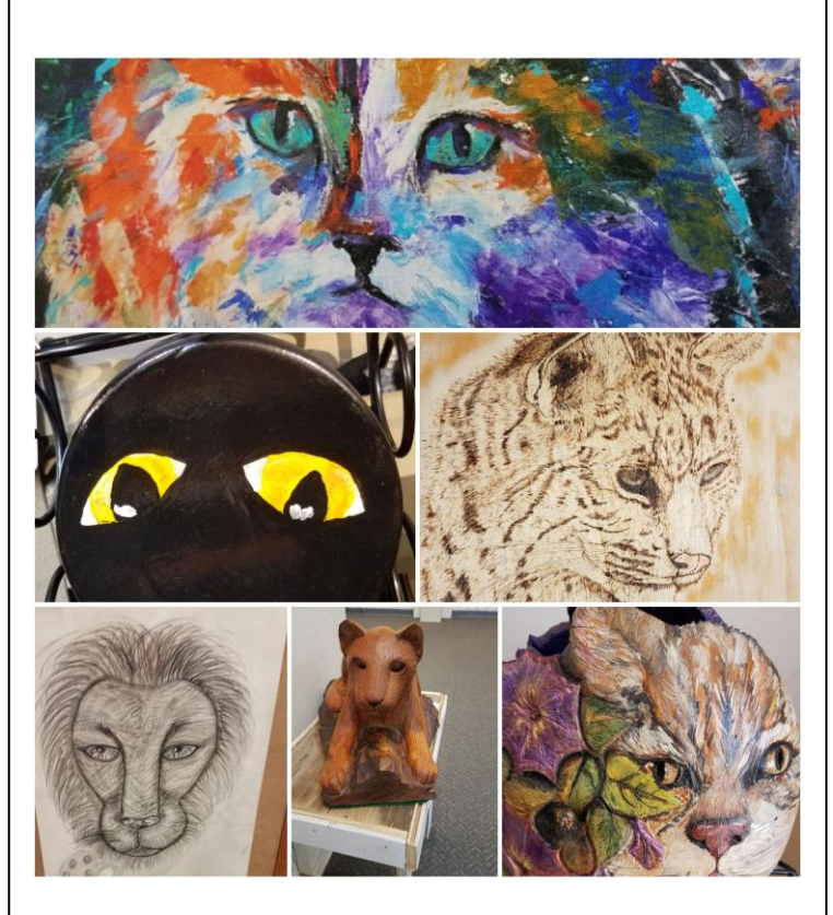
Here Kitty Kitty at the Gift Shop and Gallery

Hours for the Gallery and Gift Shop Tuesday thru Friday 10 to 4pm Saturday 10 to 2pm On the corner of 4<sup>th</sup> and San Pedro Benson, AZ 520-586-4630