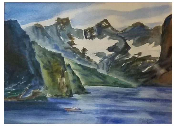
Watercolor by Geoff McLeod

Art in the Park Sierra Vista Veterans Park October 1<sup>st</sup> and 2<sup>nd</sup> 9am to 4pm