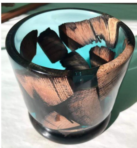
Resin and Wood by Rhett Meese