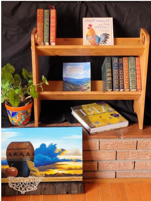
Photo of raffle prizes tickets available at gallery or at the Art Show reception.

“Painting for Personal Development” class, hosting, April - May Benson Campus Cochise College featured artist could be you and fellow horse lovers, including photos, of horses. You have time to get your work ready. You must be a San Pedro River Arts Council member at the time of the hanging.