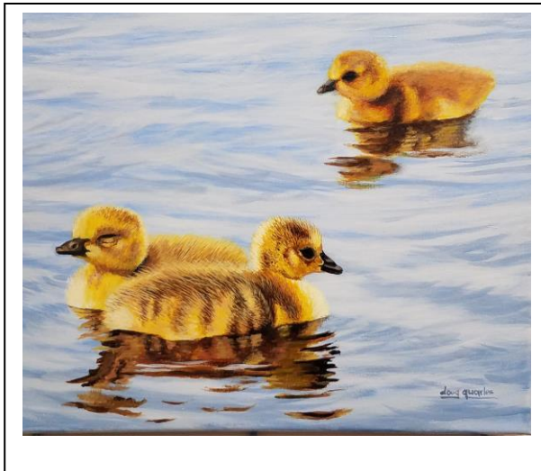
“Little Floaters” Doug Quarles