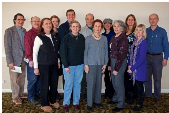
13 of the WCBA Board Members in attendance at the Winter in Westchester Tournament