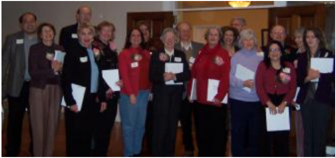
The 17 new Life Masters in attendance at the 2006 annual meeting