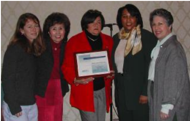
The Charity Committee is presented with a certificate from the Westchester Chapter of Juvenile Diabetes thanking the Unit for its contribution in 2004.