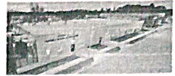
Pittsville Career and Technical Education Center

Career and technical education (CTE) is an educational approach to teaching technical skills that lead to careers for middle, high, and post secondary students. Compared to vocational education which is only taught in post secondary scenarios and is very specific to one career track, CTE can be broad in range from medical, business, sales, finance, IT, STEM, manufacturing, logistics, computer-based mathematics, political science, government, law, agriculture, construction, trades, craftsman, cosmetology, culinary, creative arts, music, to audiovisual technology. [1] The Federal Government of the United States has invested $1.462 billion in 2023 [2] and States have invested billions [3] to renovate classrooms, spaces, and build dedicated buildings for the equipment, supplies, tools, software, and hardware to accommodate CTE. [4][5]