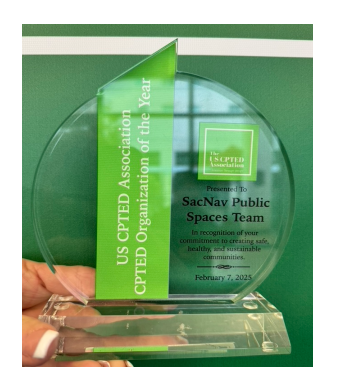
Every PBID invests in maintenance, we are offering an opportunity for their boards to invest in restoring lives as well.