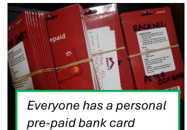
Everyone has a personal pre-paid bank card