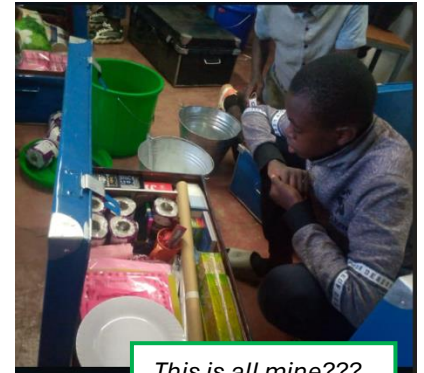
This is all mine???

to relocate the 62 students who would be returning to school in January to government schools. Our team in Kenya worked extremely hard to place the students, handle the paperwork and interviews, obtain and distribute the required supplies, facilitate payment for uniforms and obtain for every student a pre-paid bank card for their personal allowance and bus fares. It was an extraordinary feat, for which they had barely a month, and they did it! Congratulations team!