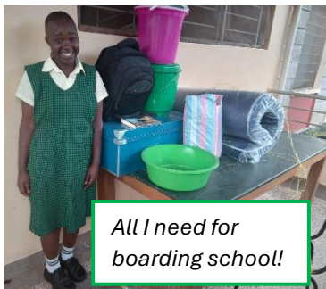
All I need for boarding school!

Once schools had started, and our 62 students were settled, we turned our attention to Primary School graduates left behind in the slums. The cost of secondary education is prohibitive for most slum dwellers. Many NGOs, community organisations, businesses and local politicians sponsor large numbers of these children, but on Feb 3 rd Kenyan news was reporting that over 300,000 students had not turned up to school for the start of Form 1. We were quickly able to send off 8 of our own from Green Pastures and Tumaini, but it took longer