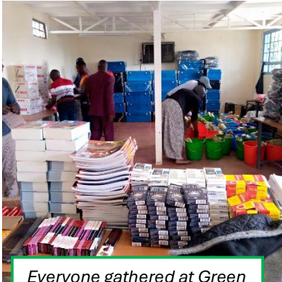
Everyone gathered at Green Pastures School for the distribution of equipment

For the past 3 years we have sent all our secondary students to ByGrace High School, a private boarding school. However, spiralling costs and difficulty recruiting and retaining good teachers has made it increasingly difficult for private schools to manage. Meanwhile the government has invested in improving the infrastructure, teaching and disciplinary standards in its schools, and has capped the fees at a level that is more affordable to us as a charity.