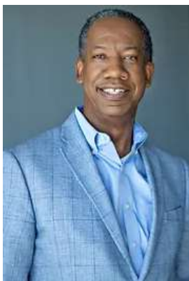
Moderator: Dewayne Scott Deputy Commissioner TN Department of Labor and Workforce Development