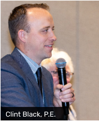
Clint Black, P.E.