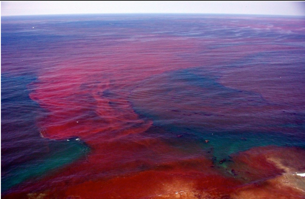
Red tide in San Diego, CA.

Red tide?- phytoplankton (dinoflagellates), algae that kill sea life and is red in color. Billions of sea life will die and pollute the oceans.