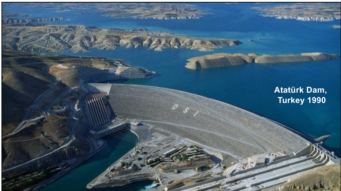
Atatürk Dam, Turkey 1990