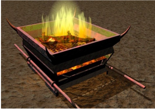
The altar of burnt offerings