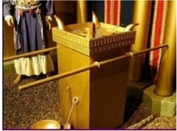
The altar of incense