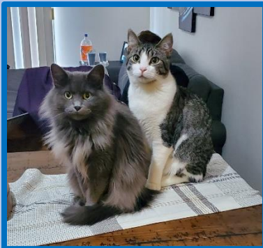
Heihe and Dory

The real love story here is between my older cat, Heihe, and Dory, who I adopted at Crestwood Animal Shelter. Heihe was making it clear when I got home from work every day that she needed some company, so I found Crestwood Animal Shelter and decided to get her a friend.