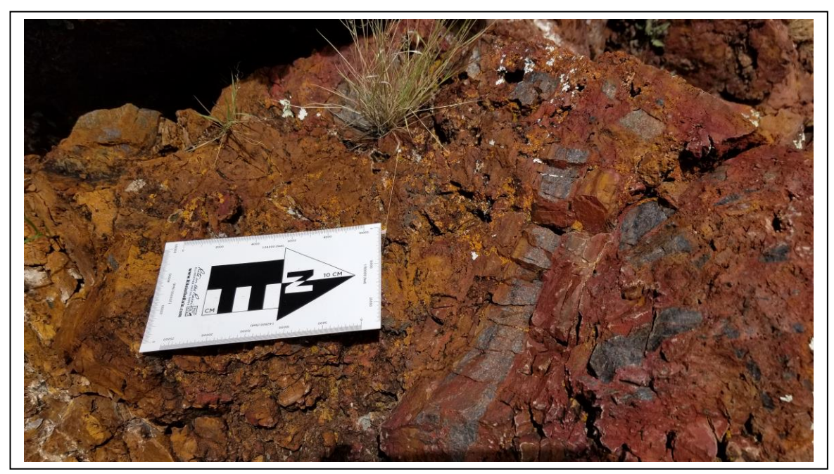
Figure 2 Jasperoid outcrop (sample containing 9 g/t Au) and to be targeted as part of the 2019 core program.

EA-001 has successfully intersected multiple zones of alteration and brecciation that remains open at depth and extends the known geological target to the north. The drill hole encountered silicified and brecciated limestone similar to those observed on the surface over a much wider zone than was anticipated. The drill hole also encountered several faults and multiple calcite veins with breccia fragments. Alteration of the rock observed in EA-001 includes silicification, extensive iron oxide mineralization, and what is believed to be significant potassic alteration (requires further study). These are visual observations by senior geologists onsite and are not confirmed by analysis; therefore, caution must taken to assume the core samples are mineralized or to what degree until assay results are received from ALS.