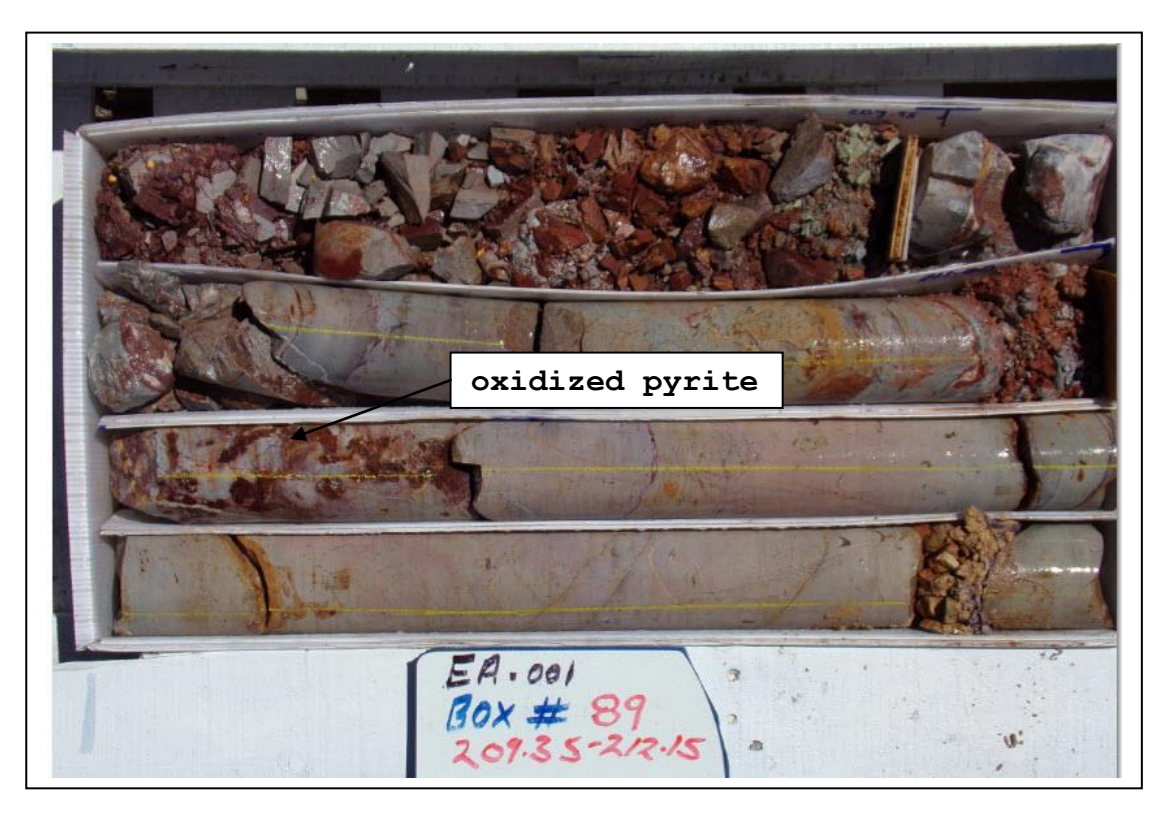
Figure 6 Core samples from EA-001, strongly oxidized sulfide within fractures.

Cross sections are currently being constructed and will be included with future releases.