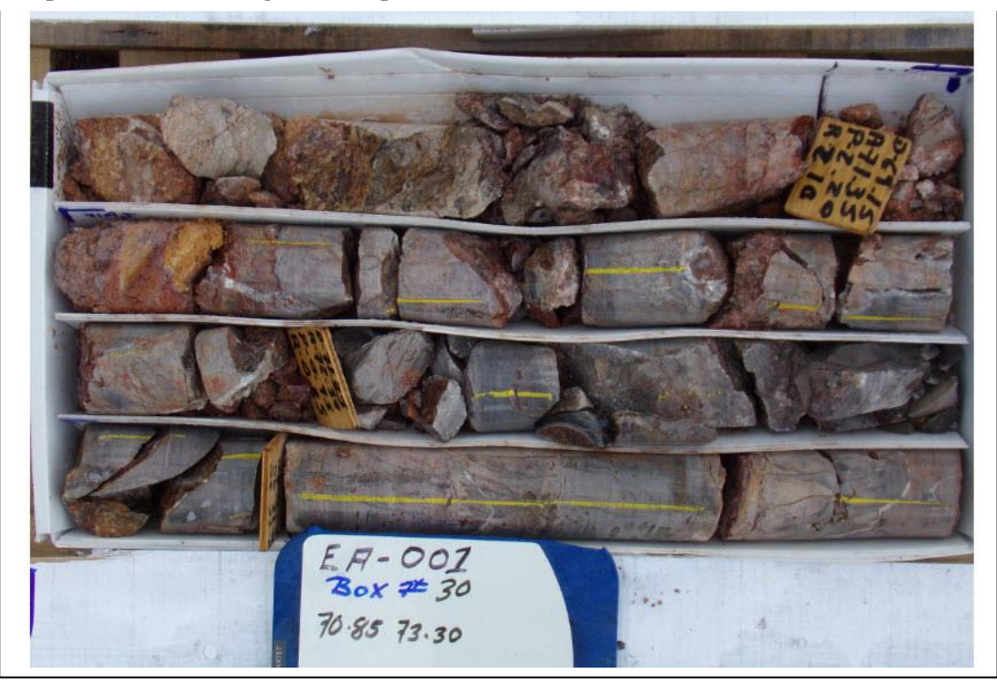
Figure 4 Core samples from EA-001, brecciated and silicified limestone at 70.85 to 73.30m and potential potassic alteration.

Figure 3 Core samples from EA-001, brecciated and silicified limestone with open spaced cavities lined with calcite and iron oxide. Yellow line indicates geologist mark for core cutter to follow, blue sample numbers are designated sample locations.