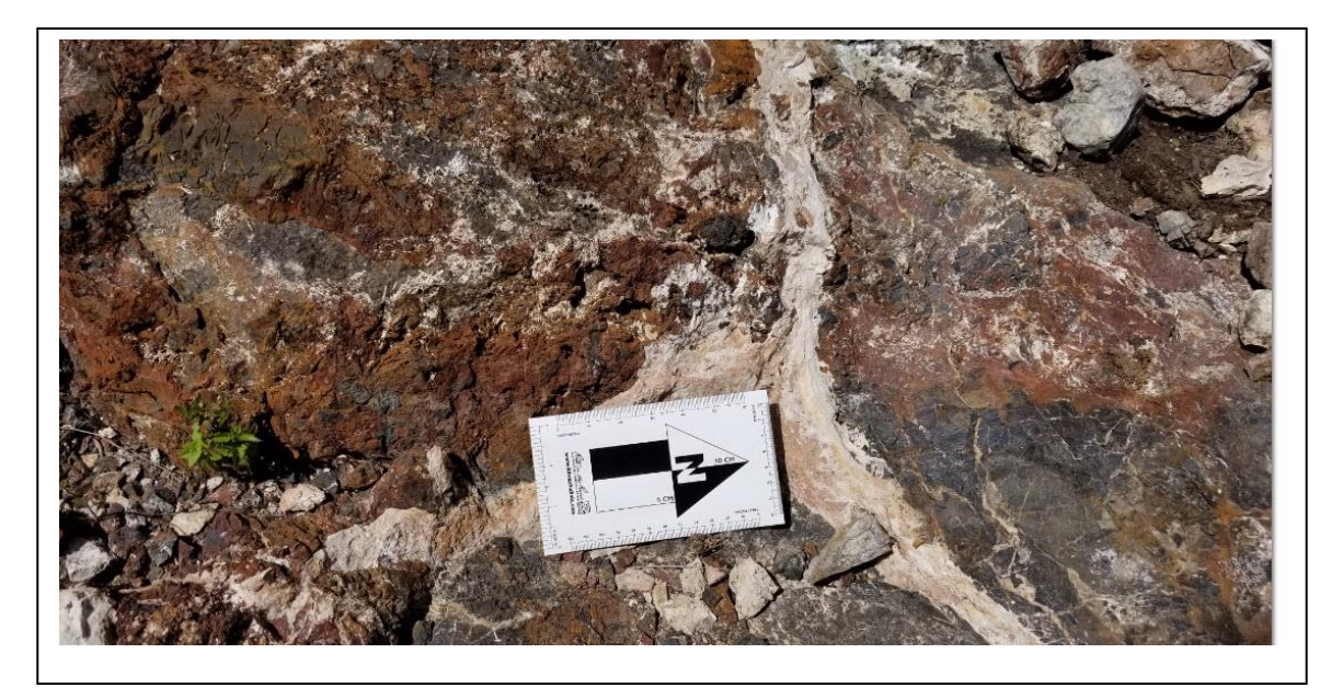
Figure 1 Example of brecciated limestone with chert, jasperoid and extensive iron oxide alteration (sample containing 20.4 g/t Au) targeted as part of the 2019 core program.

EA-001 was drilled to intersect gold mineralization known to be associated with jasperoid and karst breccias exposed along the El Alamo ridge that trends east west. Surface sampling from shallow trenches completed by Galore contained gold values from below detection (<0.005 ppm) to a high of 20.4 ppm (Figures 1 and 2).