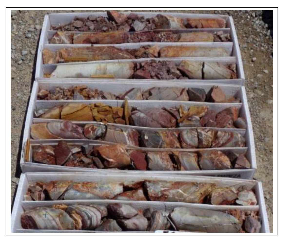
Figure 5 Core samples from EA-001, brecciated and iron oxide at 204 to 209.0m.

Figures 5 and 6 are examples of the extent of the brecciation and iron oxidation at depth in EA-001. In figure 6 the iron oxide after pyrite occurs in clasts and dissemination along fractures within the brecciated limestone.