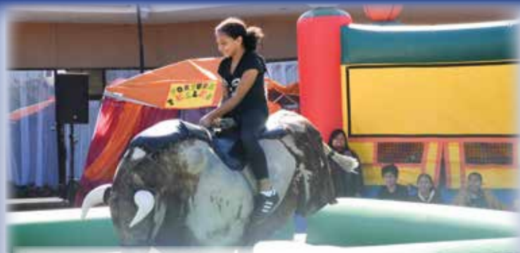
SW Houston Fall Festival saw seven saved