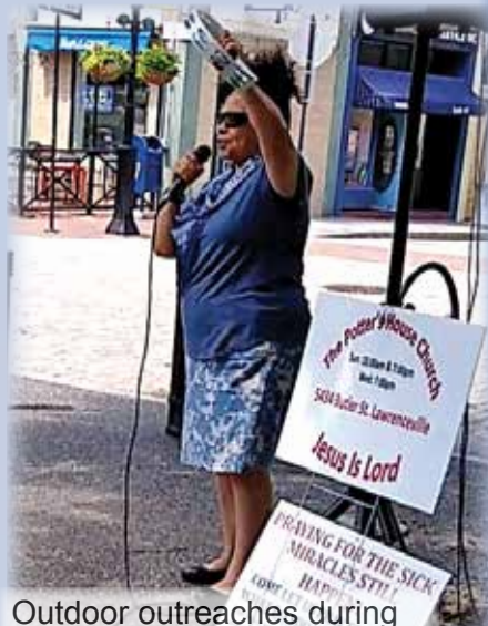
lockdown in Pittsburgh