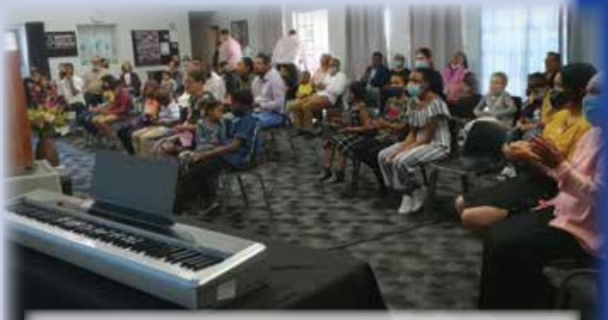
Church service in Bonteheuwel, South Africa

we went to pray for an elderly lady that visited our church. She was in so much pain that she could barely walk. The next morning she was in church! Glory to God!