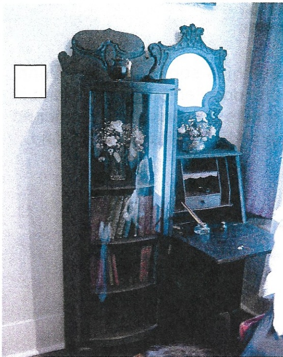
Early 19 th Century Secretary

Matching bed and Dresser are from the turn of the century. They are made of Tiger Oak.