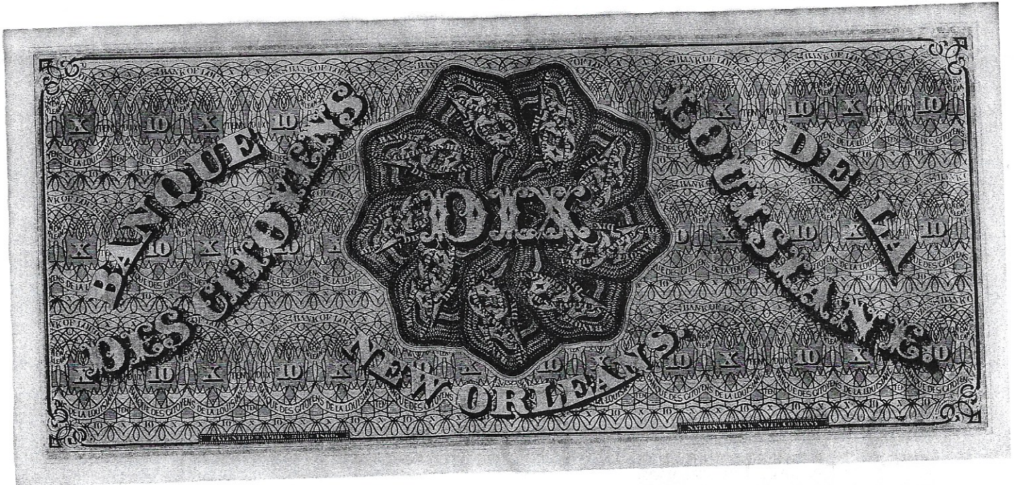
(The back of the bill)