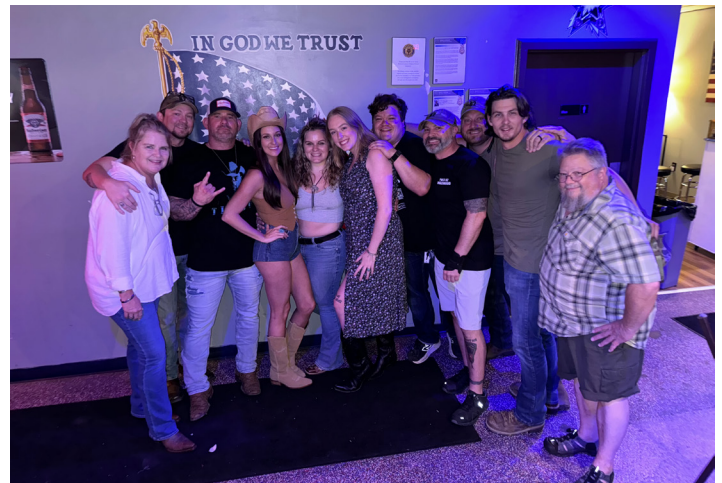
Top left: Line dance lessons. Top right: Prayer gathering. Bottom left: Tuesday Legionnaire and Auxiliary volunteers. Bottom right: With Kacey Musgraves.