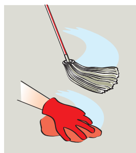
Mop or wipe surface.