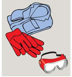
Use appropriate PPE as indicated in the Safety Data Sheet.