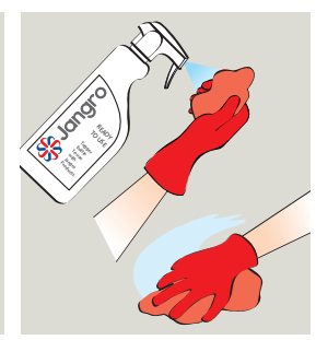
A Spray solution onto cloth and wipe.