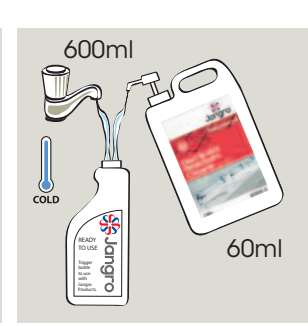
Dilute 60ml per 600ml of cold water in hand spray.