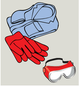
Use appropriate PPE as indicated in the Safety Data Sheet.