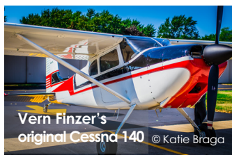
Vern Finzer's original Cessna 140

While driving in bumper-to-bumper traffic down Route 59 or walking the dog through Springbrook Prairie, you may have wondered about the planes going in and out at Aero Estates—the subdivision located a block east of Route 59 between 79th and 83rd Streets. If you looked closer, you probably noticed that not only do they have garages, but hangars with a landing strip in their backyards and access to their own airport!