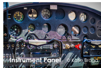
Instrument Panel © Katie Braga