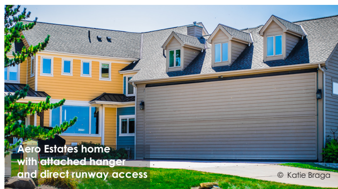
Aero Estates home with attached hanger and direct runway access

Aero Estates is one of only five such subdivisions in the greater Chicago area. Built in 1956 by Vern Finzer and Harold White (the one-time owner of the Naperville Sun), it features 120 single-family homes and two runways, along with one-acre yards and unobstructed views of the sunrises and sunsets.