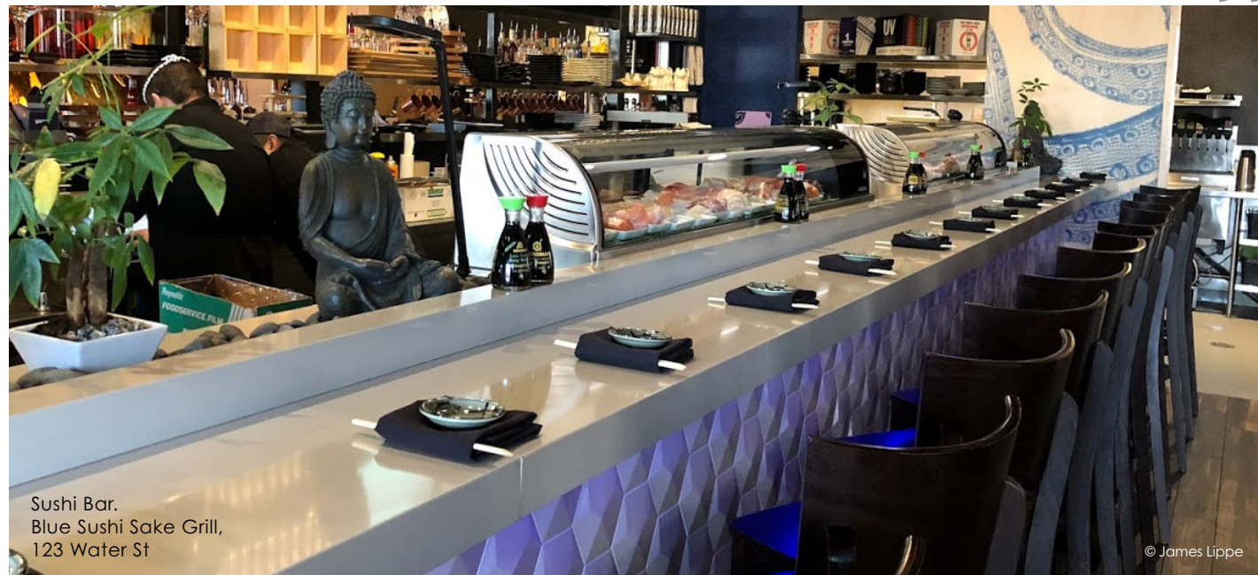
Sushi Bar. Blue Sushi Sake Grill, 123 Water St

“We both grew up in families and communities where heart and soul were brought to every meal, and where the table was a place of conversation and sharing life.”