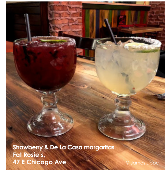
Strawberry & De La Casa margaritas. Fat Rosie's, 47 E Chicago Ave