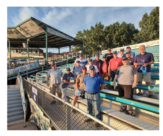
Remember the Power Prayer is strong. Please add the Women's #78 AND Men's #79 Cursillo Weekends; Team and Candidates to your prayers!