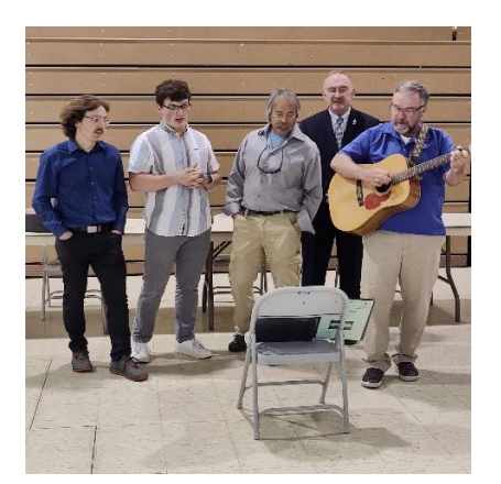
Cursillistas having fun at a Growlers Game