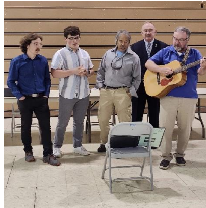
Cursillistas having fun at a Growlers Game