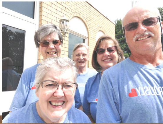
Summer Lunch Delivery Crew