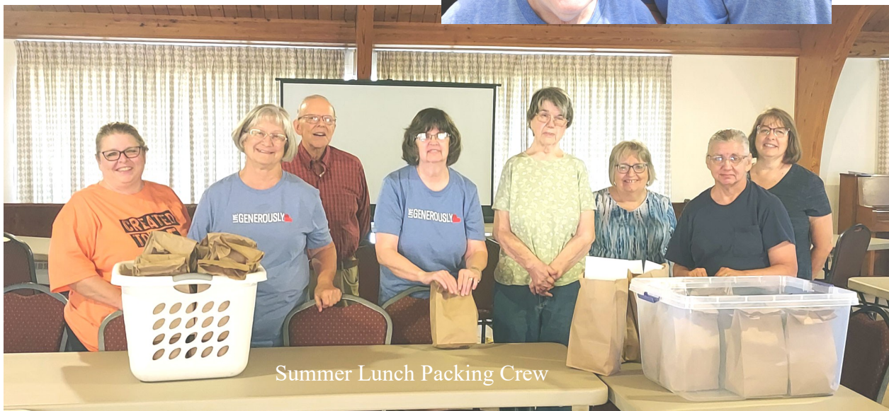
Summer Lunch Packing Crew