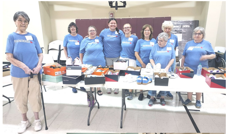
Back-to-School Volunteers and tables full of school supplies