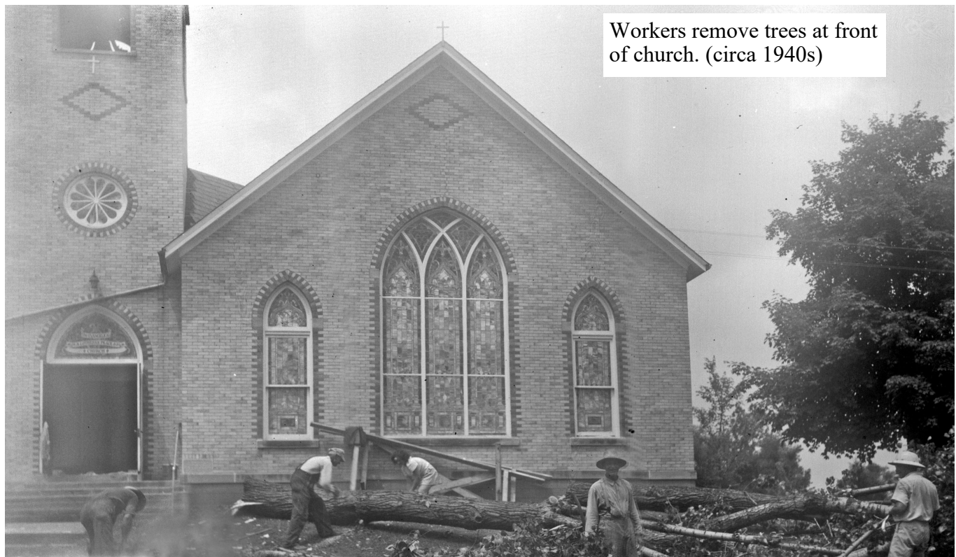
Workers remove trees at front of church. (circa 1940s)

And we thank the youth and their leaders for their early Easter events. Thank you to the young people for the Easter Sunrise Service. Thanks to the LYO for a delicious Easter breakfast and thanks to those who donated breakfast items.