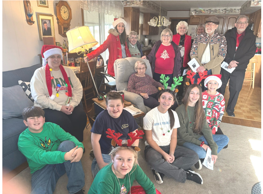
LYO and Friends Christmas Caroling

Thank you to all who provided cards. It was a great turnout!