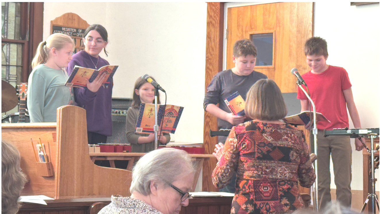
The Sunday School Children present a "Songs of Thanksgiving" prelude.