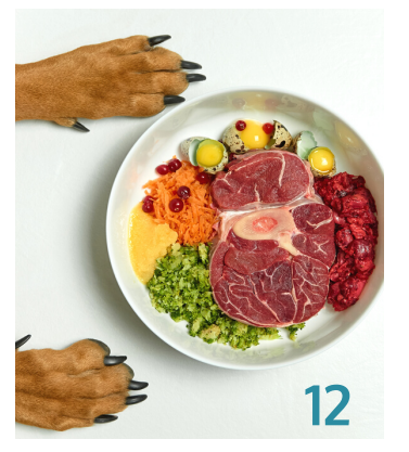
SUPER-FOODS TO IMPROVE YOUR PET'S DIET