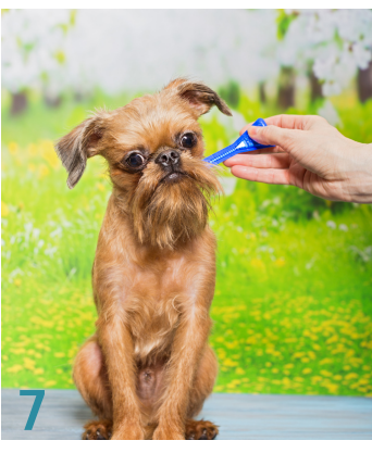
MINIMIZE FLEA & TICK PREVENTION CHEMICALS