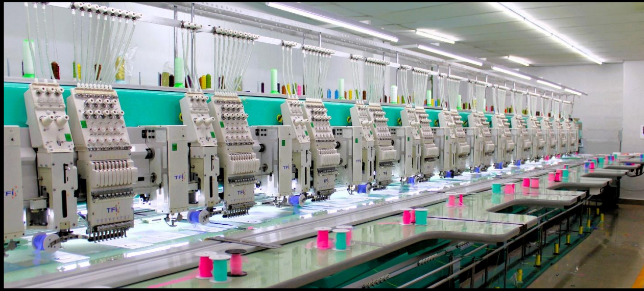
1 - TFI MACHINE WITH TAPING AND CHENILLE