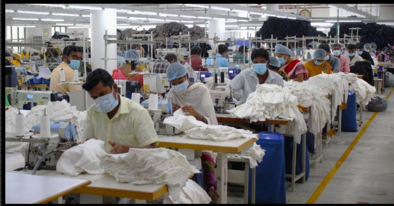
Production line (sewing)