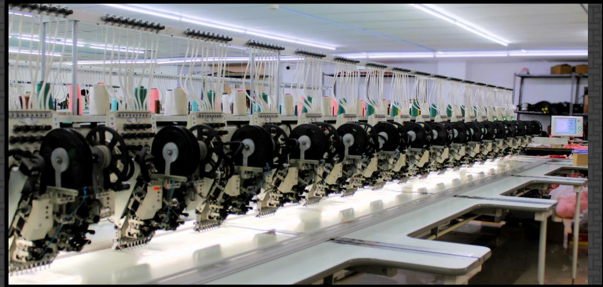
5 - TAJIMA MACHINES WITH SEQUINS