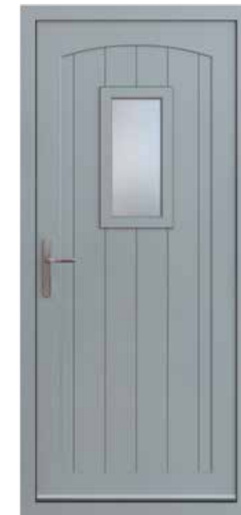
BROADFIELD | DT3002 The traditional Broadfield design brings a perfect country cottage look to any home.