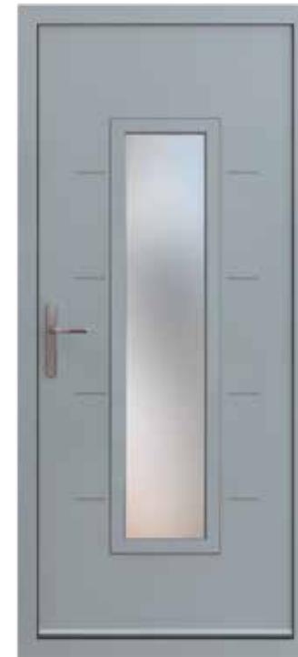
CARNABY | DM3001 A modern classic providing elegance and style, allowing light to flood into the home.