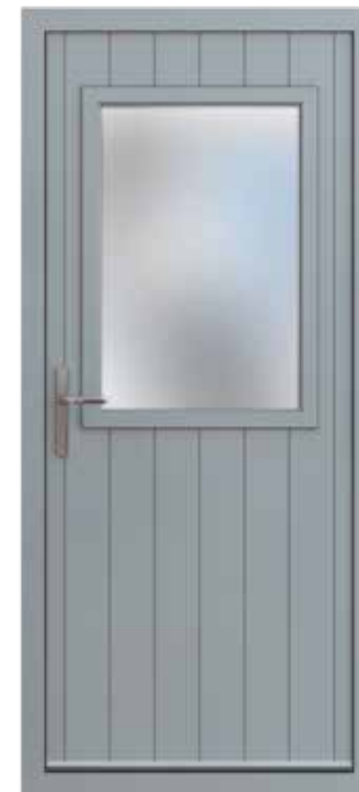
WOODCHESTER | DT3001 This fabulous new back door delivers all the benefits of its front door counterparts.