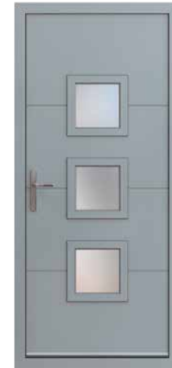
LANSDOWN | DM3002 Three glazed panels add an interesting design twist to this stylish, modern entrance door.