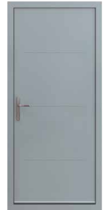
MILLBROOK | DM3003 A timeless classic, this solid entrance door oozes understated elegance and style.