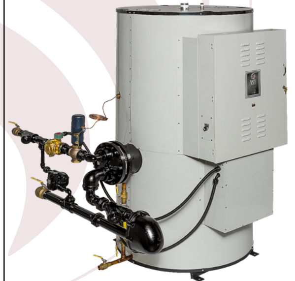
Hybrid Hot Water Generator/ Power Electric Water Heater