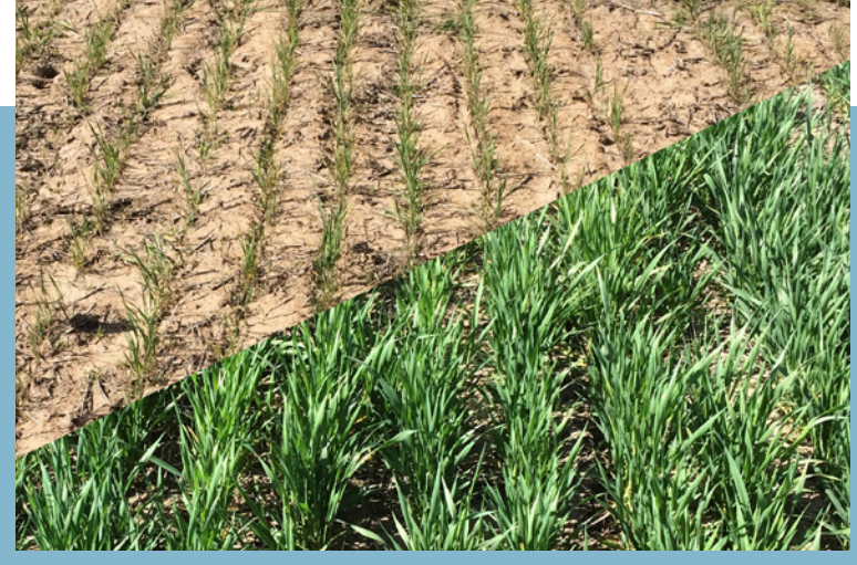
The growth of wheat in Eastern Washington in soils amended with biochar vs. unamended soils.

In 2013, the USDA-ARS established trials at the Gady Farm to compare the impacts of the seed cleaned