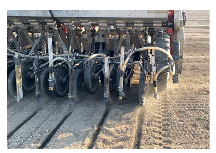
Biochar slurry application using a sprayer.

Micronized biochars can be suspended in water and injected into the root zone of perennial crops or fertigated, which could provide a slow but steady method of adding biochar to the root zone via irrigation water.