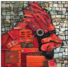
AMY WEH // 2DMIXED MEDIA & MOSAIC