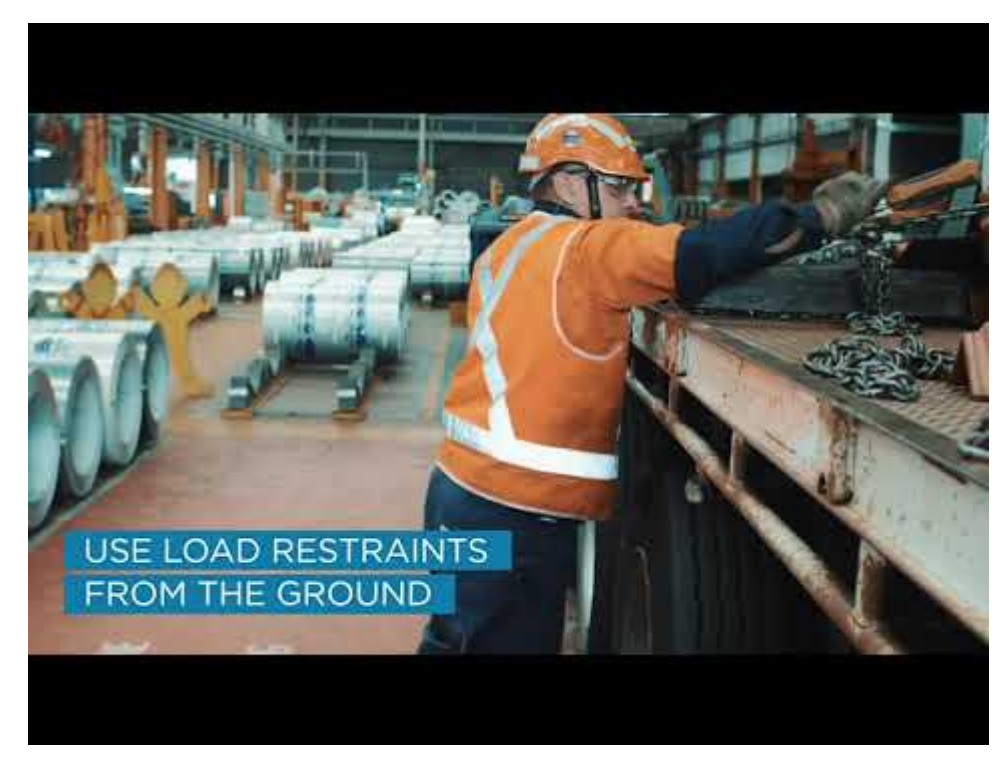
Watch Video At: https://youtu.be/dxjkE4jHwic

Workers have suffered dislocations, broken bones, severe lacerations and head injuries and in some cases workers have died.