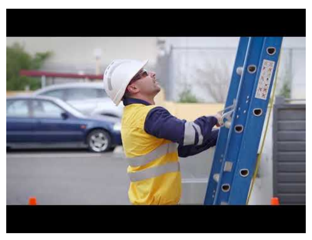
Watch Video At: https://youtu.be/flrzZ16nDzg