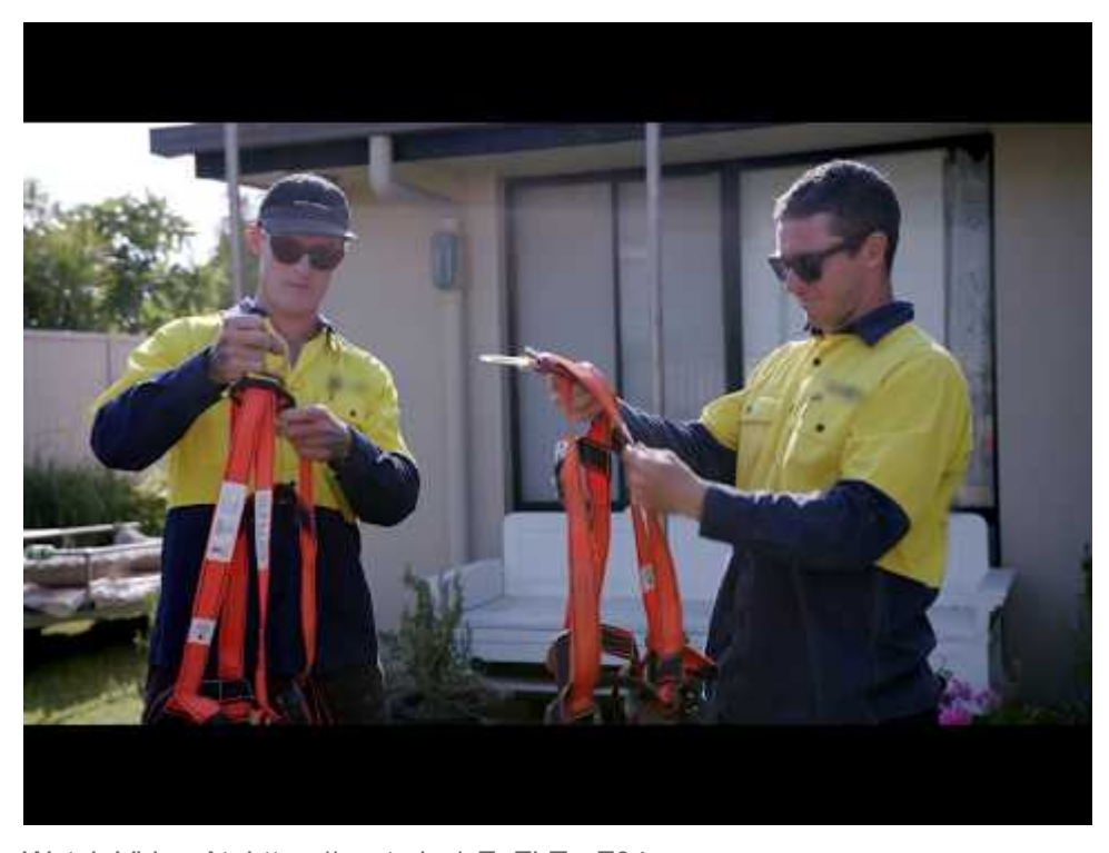
Watch Video At: https://youtu.be/cEgZhTozZ94