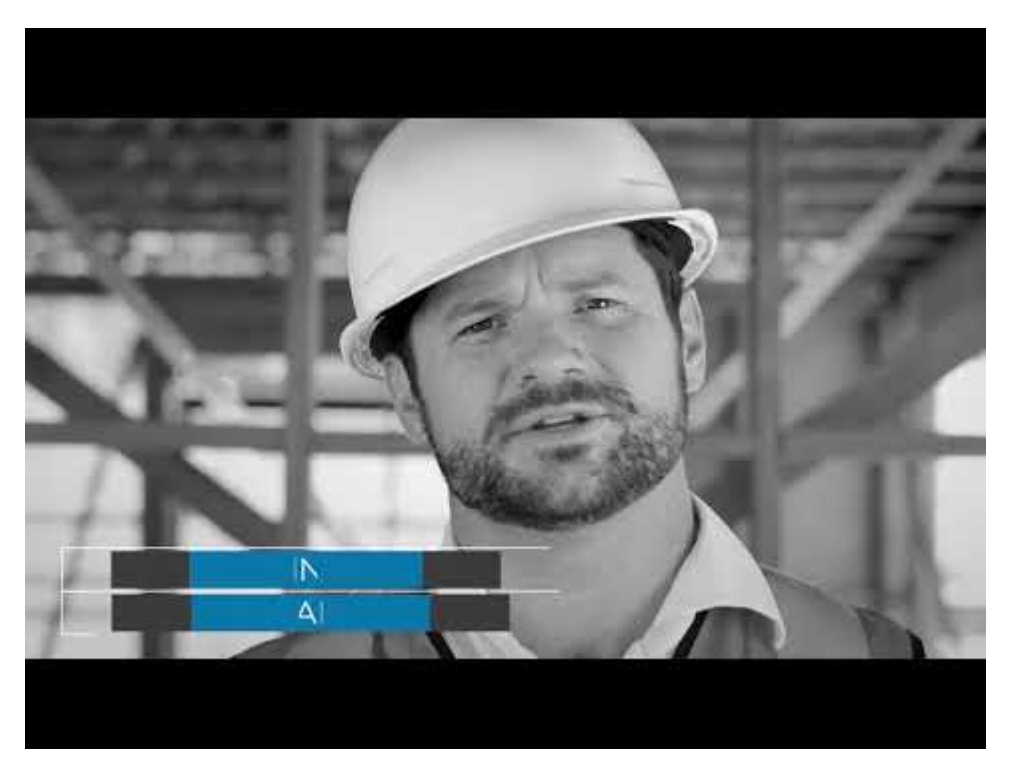
Watch Video At: https://youtu.be/XP1yIXHfswc