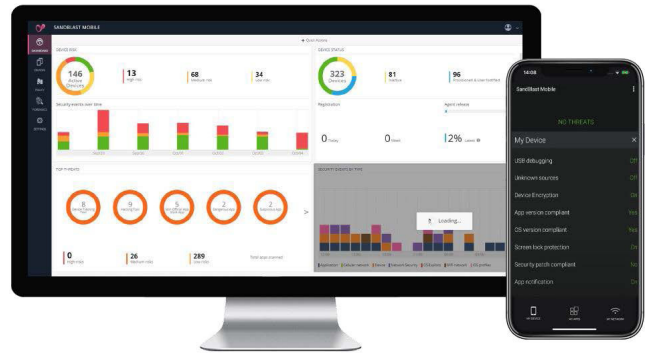
Harmony Mobile Management Console

Easy to manage: a cloud-based and intuitive management console provides the ability to oversee mobile risk posture and set granular policies. Harmony Mobile also expands your mobile application deployment security by giving administrators an application vetting service, allowing them to upload or link applications (both Android or iOS) into the Harmony Mobile Dashboard and receive a full app analysis report within a few minutes.