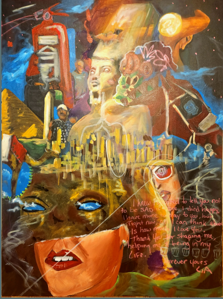
"Breath of Egypt" 36' X 46' $1500 Acrylic on canvas