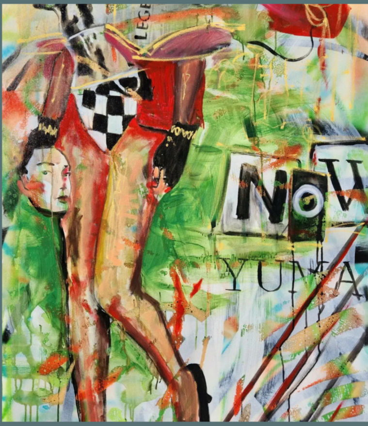
"Now, YUMA" 36' X 46' $900 Acrylic on canvas