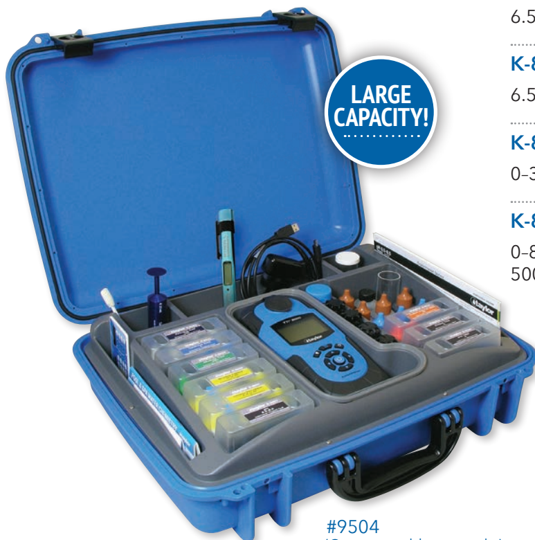
#9504 (Contents sold separately.)

0-80 ppm NaCl; by dilution: 75-150, 150-500, 500-2000, or 2000-8000 ppm NaCl