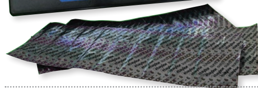
S-1325 Test Strips