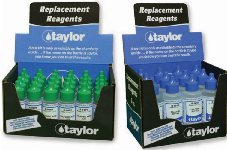
REPLACEMENT REAGENTS sold in .75 oz. and 2 oz. bottles.