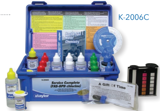
Kits include English or Spanish 2004B booklet plus circular Watergram® with instructions in English.

Additional 2000 Series kits are listed in the Pool & Spa Water-Testing Products Price List posted on our website.