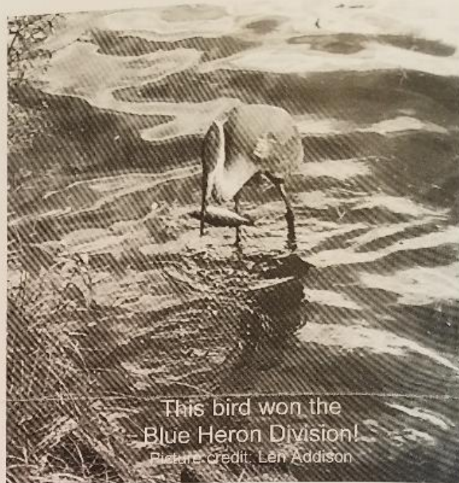
This bird won the Blue Heron Division!