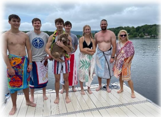
Pictured L to R;