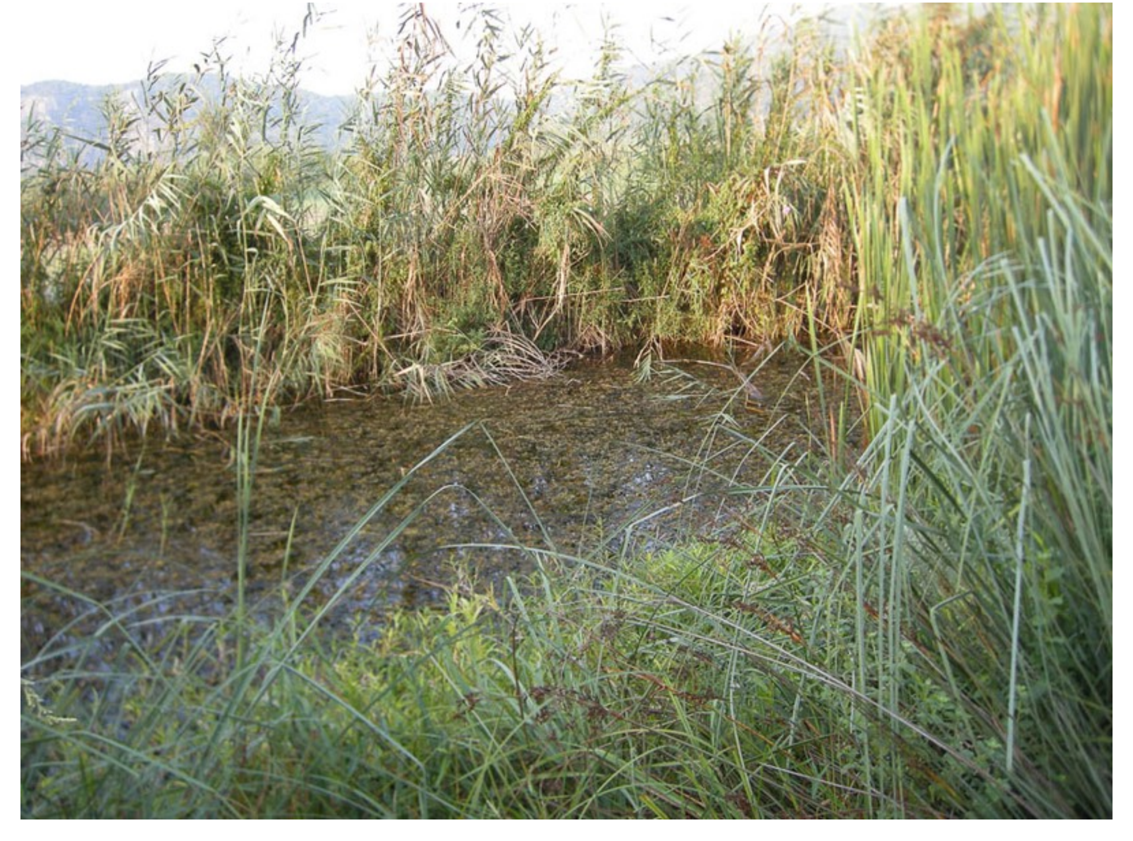
12 : Keep going until you come to a clearing at the end.

13 : There will be the canal on your left and good views over the reed beds towards the' Rocky Outcrop' on your right. It is possible to keep going but often the ground is water logged and this is the end of the route. Retrace your tracks to return.