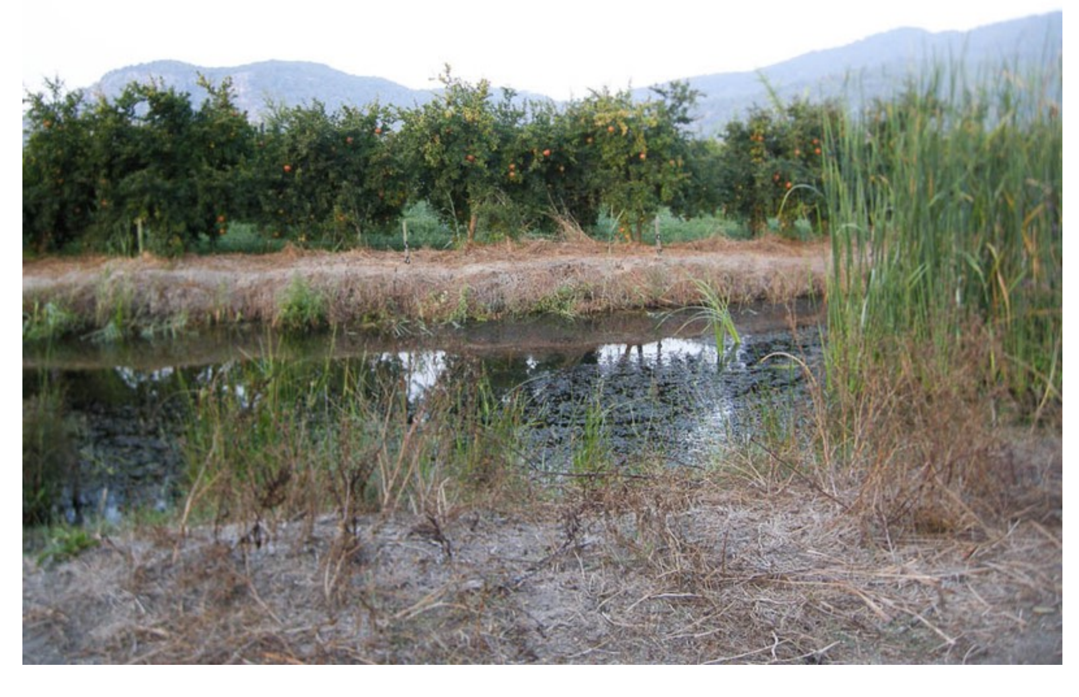
10 : With the canal on your left follow the track.

9 : The single track will shortly come to an open space. The canal will be on your left.