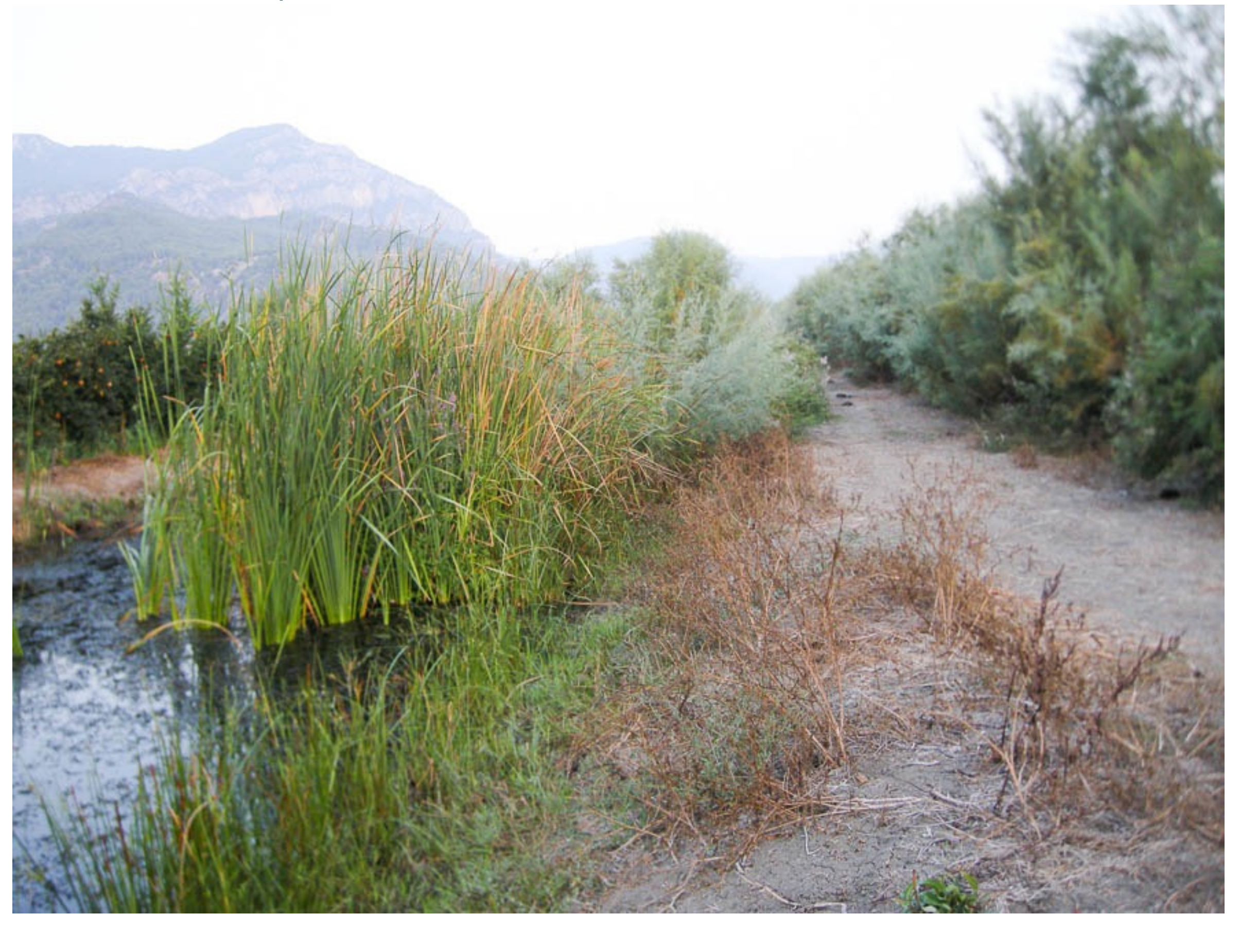
11 : The track will be over grown on both sides, but there are gaps where you may see Little Crake.