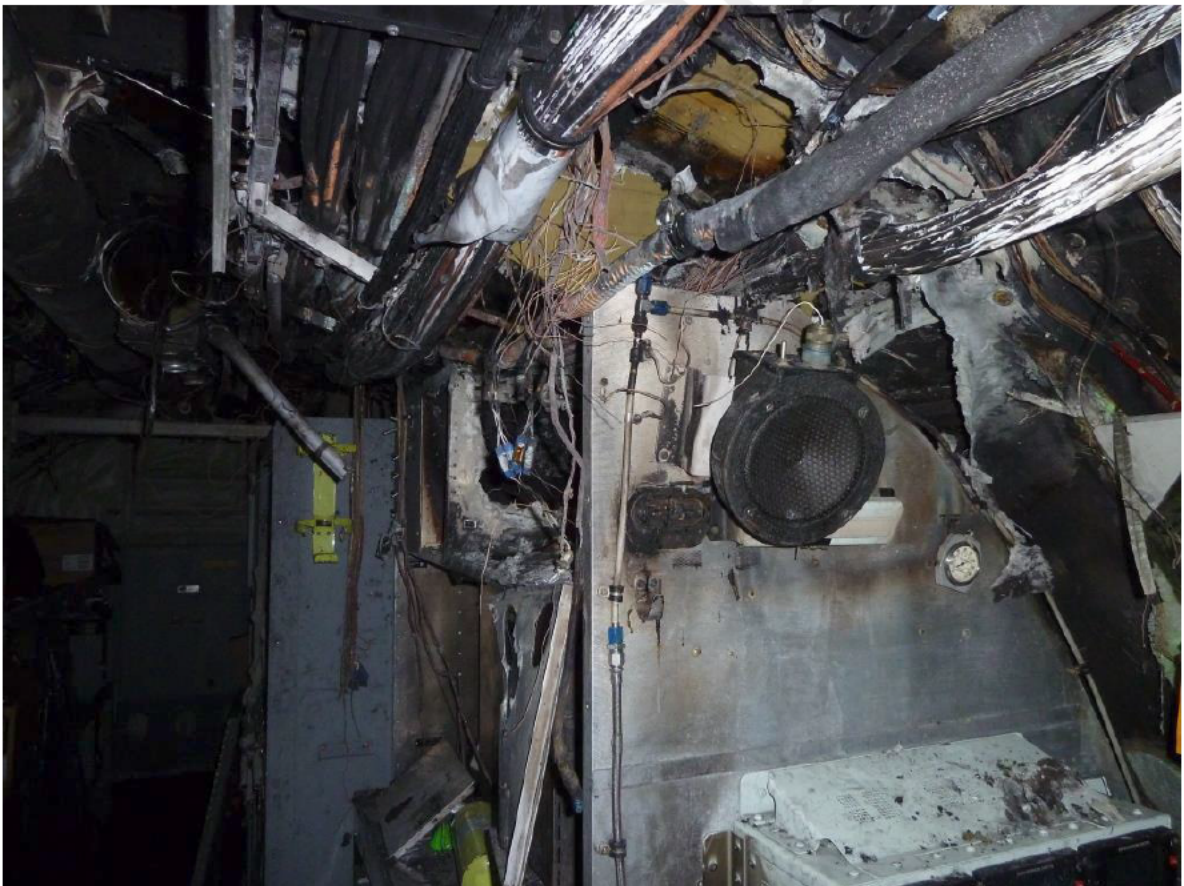
Interior damage caused by the fire.

In part, the fire onboard aircraft RC-135V 64-14848 was a result of negligent aircraft maintenance practices passed down through the generations.