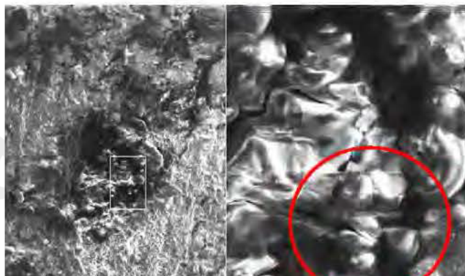
Figure 26: Evidence of pitting on junction #11 tube adjacent to sleeve after cleaning by acetate replication. Similar to the sleeve, the pitting was more prevalent on one side of the tube. A secondary electron image at the bottom of the figure shows nodular formations, circled in red, in the pit. The nodular formations are consistent with melting. Melting damage was localized in the pitted features. (Ref Tab J-38)

The AIB Report did not consider the above-mentioned electrical system anomalies. Likewise, the AIB Report ignored the ‘electric arcing’ that caused tiny pits to form in the oxygen tube at junction #11. The AIB Report did not discuss the physics behind an electric arc, such as voltage, conditioned cabin air, cabin pressure, and trace gasses within an RC-135. To be direct, the AIB Report failed to consider electrical arcing at junction #11, as a possible source of ignition.