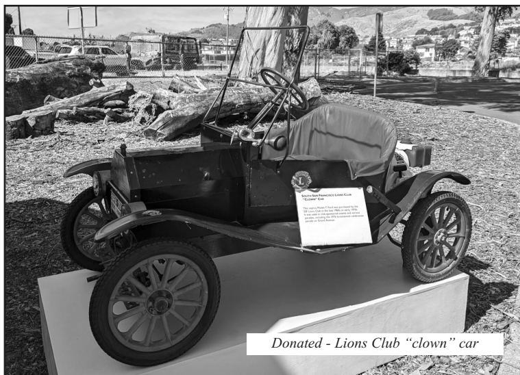
Donated - Lions Club "clown" car