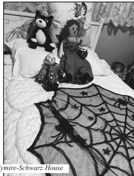
Halloween Fun at the Plymire-Schwarz House