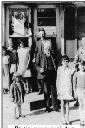
Partial museum window shade photo

After living an exciting life, Norma passed away on July 26, 2023 at the age of 95.