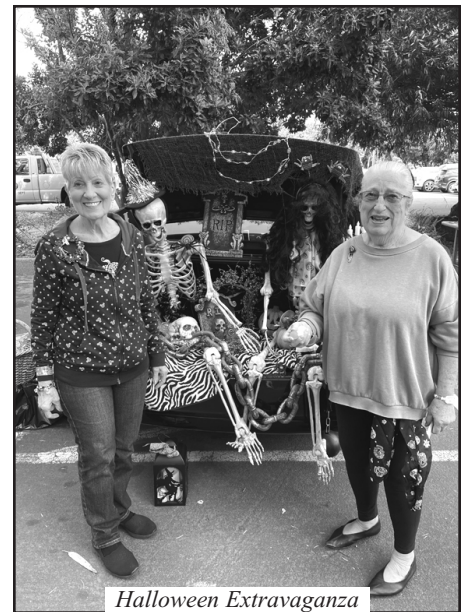
Halloween Extravaganza Trunk or Treat

Thanks to our members who helped make our presence at these events possible.