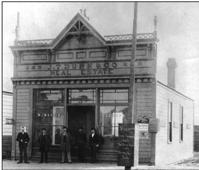
South San Francisco Post Office moved to J. T. Dunn Real Estate Company building in 1894