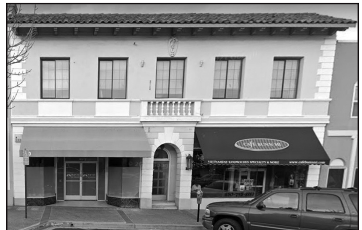
1925 Post Office on Grand Avenue - Now