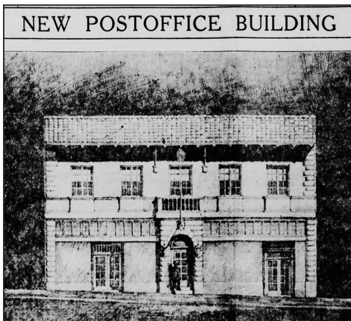
1925 Grand Avenue Post Office

In 1895 the name of the post office was changed from "South San Francisco" to "Baden." This change was made by the Postal Department at the instance of the people of the "Butchertown" district of San Francisco who complained that mail intended for them was frequently sent in error to the "South San Francisco" San Mateo County post office. However, even after the change, Butchertown mail continued to get delivered to the office in Baden so on December 14, 1897, the original post office name was restored to "South San Francisco."