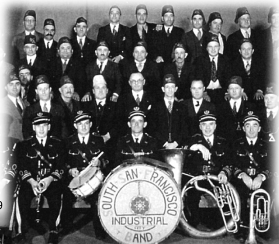
SSF Industrial Band 1915